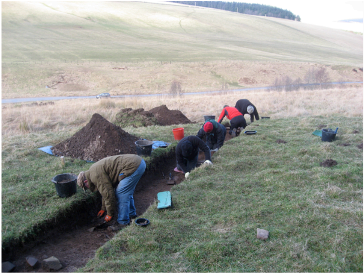
Fig 2 Excavation in progress in Trench 1, March 2013